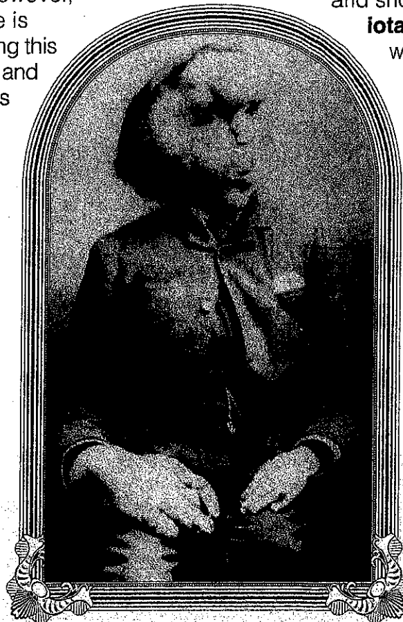
Joseph Carey Merrick, known as the Elephant Man

Merrick contacted a showman and offered to put himself on exhibit. Thus, "the Elephant Man—half-