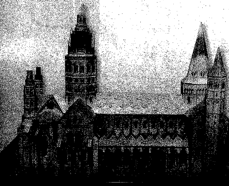
Joseph Merrick made intricate models of churches and other buildings.

The world that treated Merrick so cruelly in life treated him with respect upon his death. A memorial service was attended by doctors, nurses, royalty, actors, and artists. A fitting epitaph might be: You'll never understand a person until you walk a mile in his shoes.