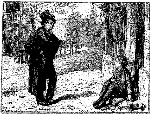
Like many of the novels of Charles Dickens, Oliver Twist examines the lives of the rich and poor in nineteenth-century England.