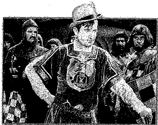
Mark Twain was one of the greatest humor writers in American literature. In A Connecticut Yankee , his main character goes back in time to the era of knights in armor.