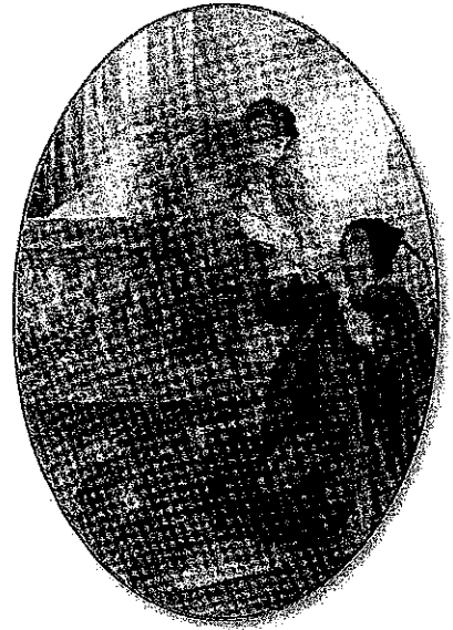
The story of Romeo and Juliet's ill-fated love has captivated audiences for centuries.