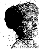
for Sore Throat."