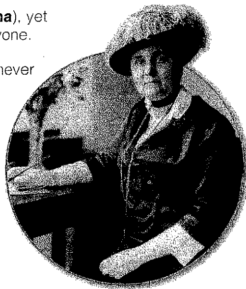
Jane Addams was a social reformer whose work earned her a Nobel Peace Prize in 1931.