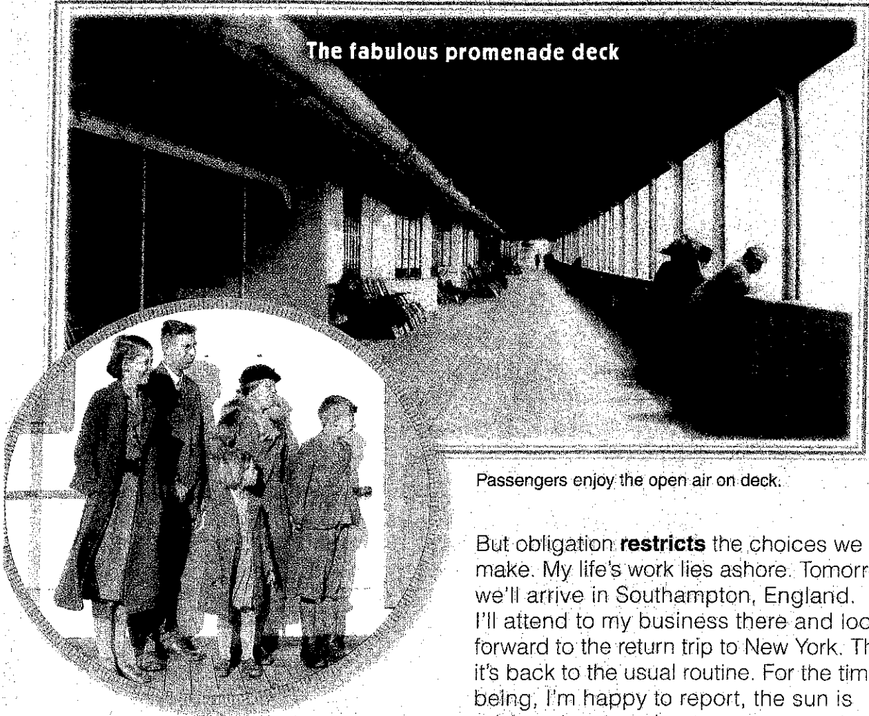
Passengers enjoy the open air on deck.

But obligation restricts the choices we make. My life's work lies ashore. Tomorrow we'll arrive in Southampton, England. I'll attend to my business there and look forward to the return trip to New York. Then it's back to the usual routine. For the time being, I'm happy to report, the sun is setting, the squash racquets are tucked away, and all's well on the Olympic .