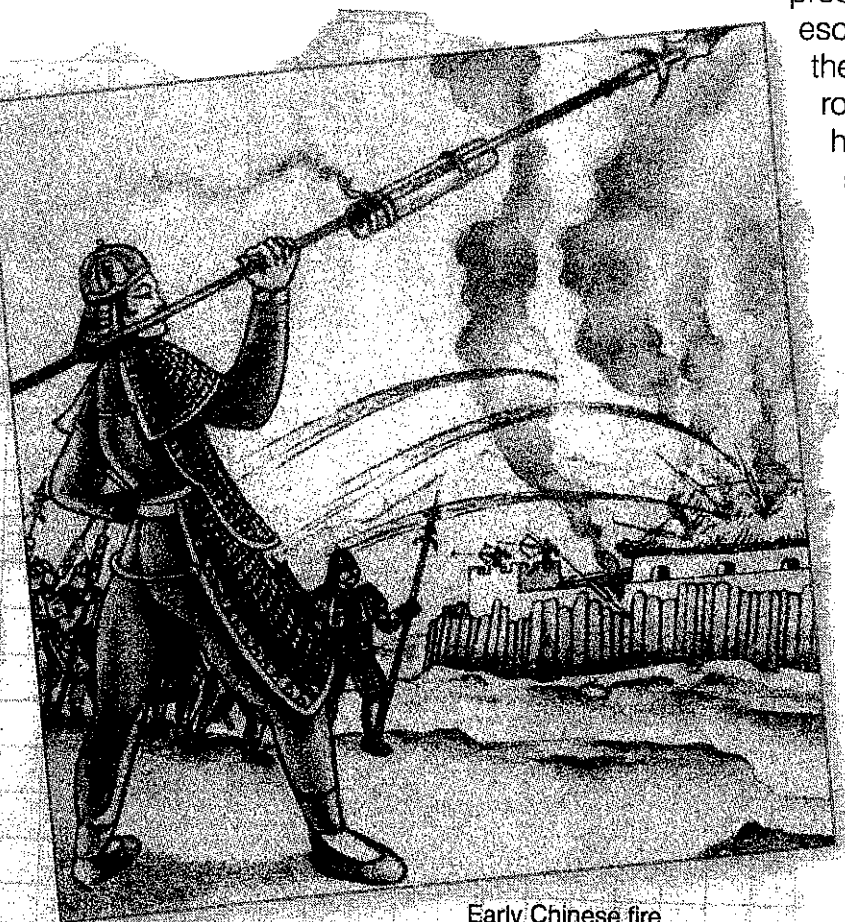
Early Chinese fire arrow rockets, c. 1000

produced fire, smoke, and gas that escaped through the open end of the tube. This force propelled the rocket through the air. The arrow helped to keep the rocket steady during flight, though its course remained quite variable . These earliest rockets may not always have done much damage on impact . But a deluge of many fire arrows could cause outright fear in the enemy. Gaining something in defeat, the Mongols learned to make similar rockets. The new technology spread rapidly across Asia and Europe. But improvements in the basic design proceeded slowly at a sluggish pace until more modern days.