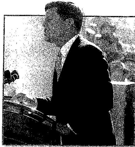
President Kennedy, in his famous Inaugural Address, said: “Ask not what your country can do for you—ask what you can do for your country.”