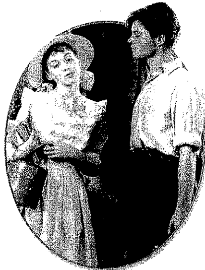
The 1934 film version of Anne of Green Gables focuses on the developing romance between Anne Shirley and Gilbert Blythe.